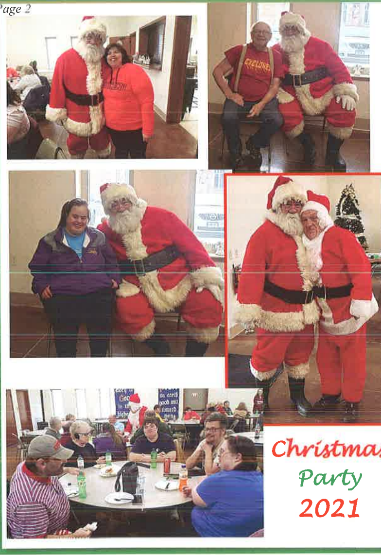
Christmas Party 2021