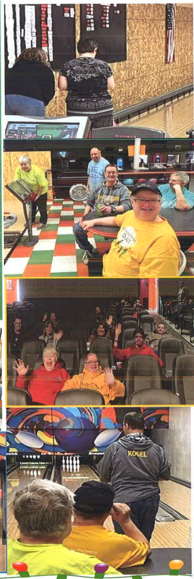
Below: Scenes from the many activities the members do weekly. Bowling, movies and bingo are their favorites.